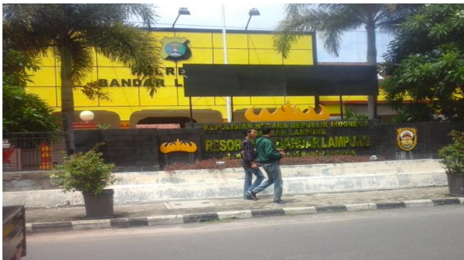
Polres bandar lampung