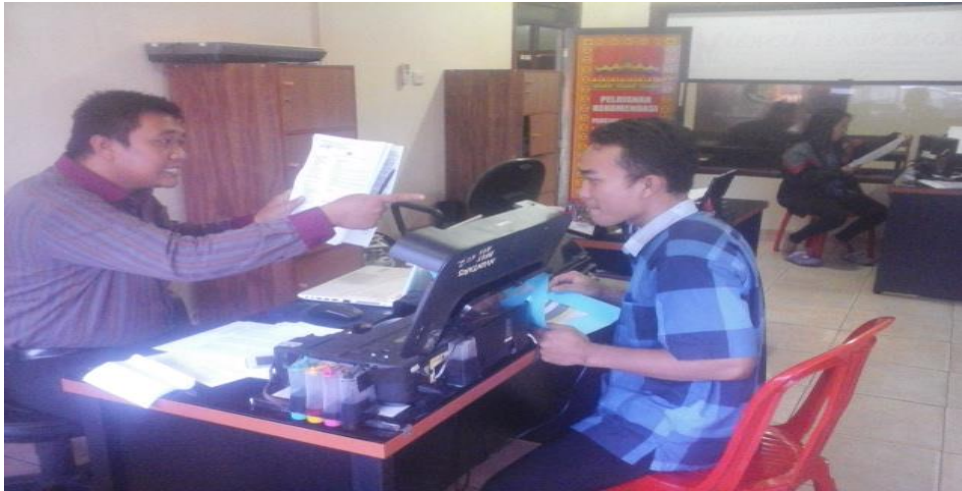
Proses pengumpulan data di polres bandar lampung