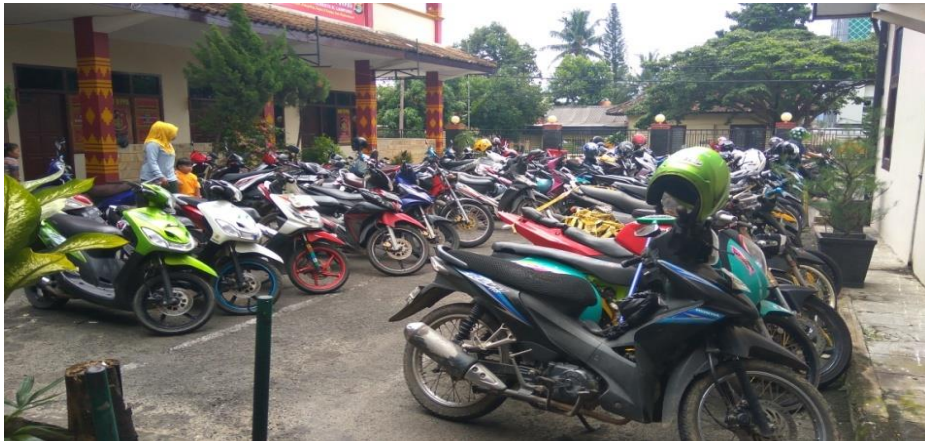
Kendaraan hasil pencurian sepeda motor