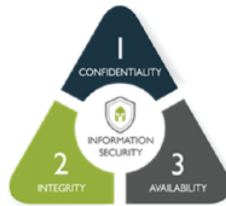
Figure 1. Information Security Concept

OCTAVE Allegro methodology emphasizes good information security management in agencies or institutions. The governance in question is governance in storing information, processing data into information and distributing it (Nastiti & Haryani, n.d.). This method, developed by the Carnegie Mellon University Software Engineering Institute (SEI), is often used by companies or institutions, both private and government. This method is quite popular for providing assessments of information system implementation such as storing and distributing information as well as detecting information security threats (Gerardo & Fajar, 2022). Identification of these risks is related to the organization's behavior in carrying out its business processes and provides an assessment of the weaknesses of the systems that have been implemented (Gala et al., 2020). For this reason, it is necessary to evaluate the implementation of information governance in order to obtain ideal conditions for ensuring information security.