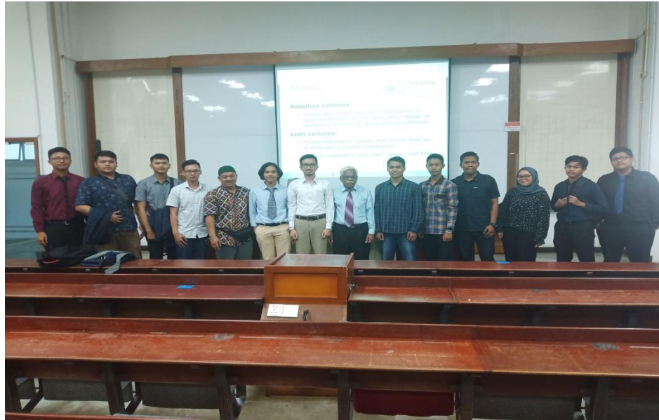
Gambar 4. Sit In Class Materi “ Research Methods “