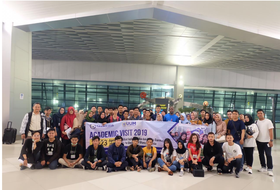
Gambar 2. Anjung Tamu UUM