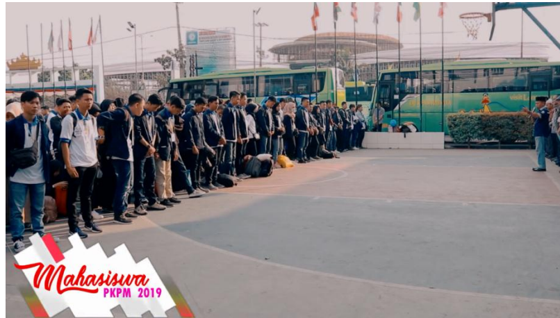
Gambar 3.1 Bukti-Bukti Kegiatan Desa