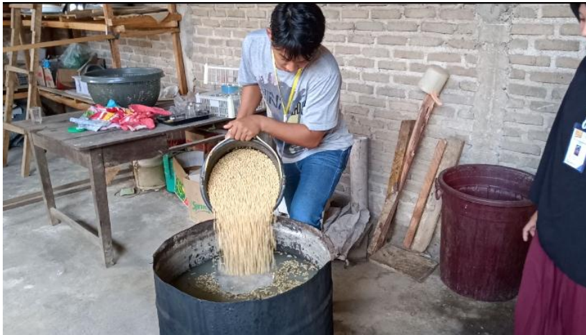
Gambar 2.1 Bukti-Bukti Kegiatan UKM