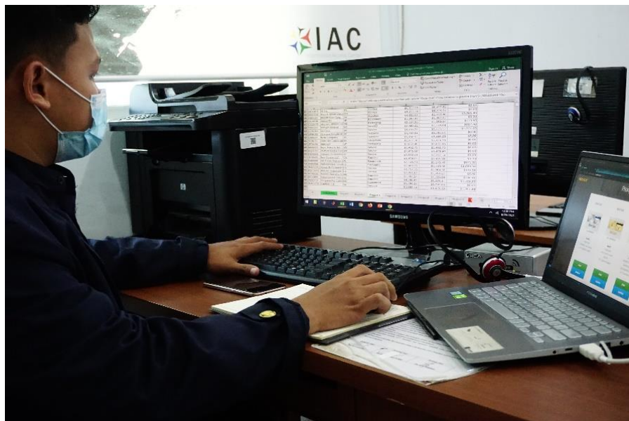
Evaluasi data penjualan produk Startup Recycle Indonesia