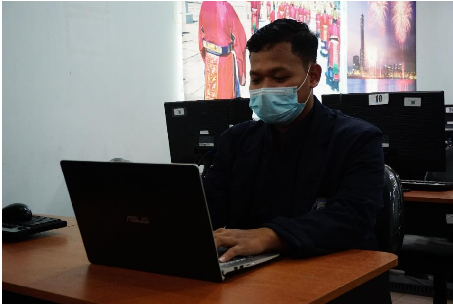
Pemantauan Layanan pelanggan / Customer Service