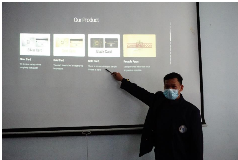
Pengenalan Halaman website Produk