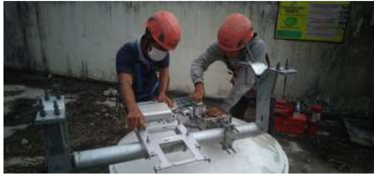
Gambar 5. Proses pemasangan Antena Microwave ipasolink 400 NEC