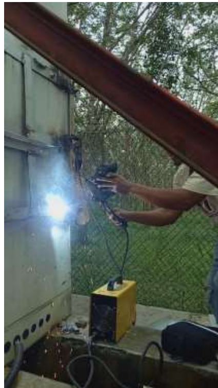
Gambar 8. Proses Pengelasan Reckty/ Rak 19, untuk Menghidari Tindakan Kriminal Berupa pencurian Battery.