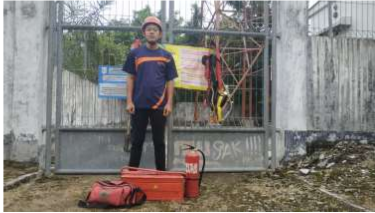
Gambar 1. Lingkungan kerja PT. Adma Indah Sentosa.