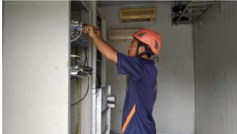
Gambar 3. Pemsangan Kable Coaxial pada perangkat VR 4.