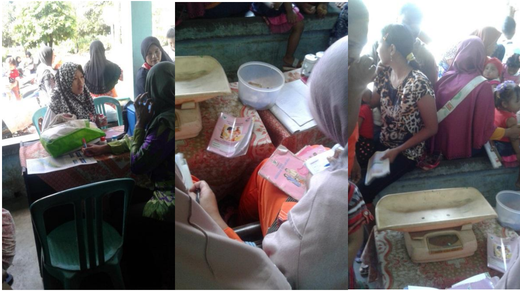
Kegiatan Posyandu Angrek