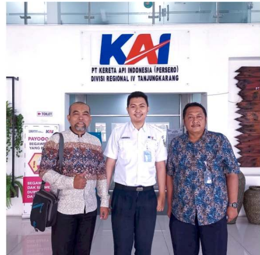
Kunjungan Dosen Pembimbing Lapangan