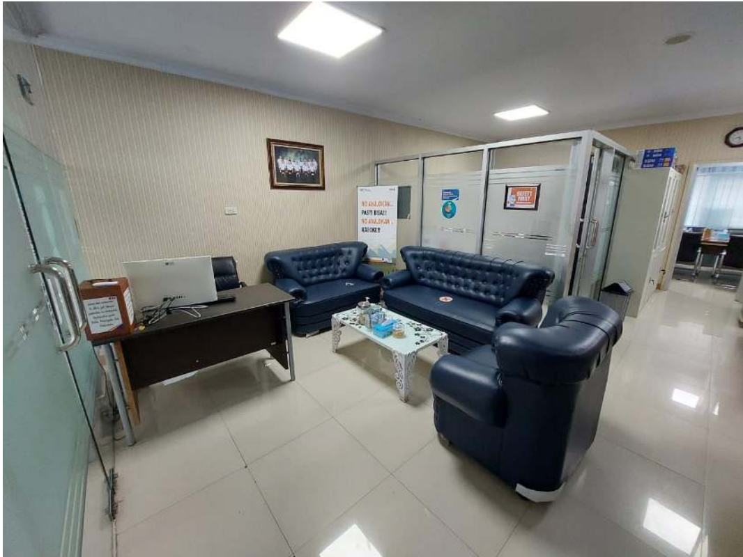
Ruang Unit Angkutan Barang PT KAI Divre IV Tanjung Karang