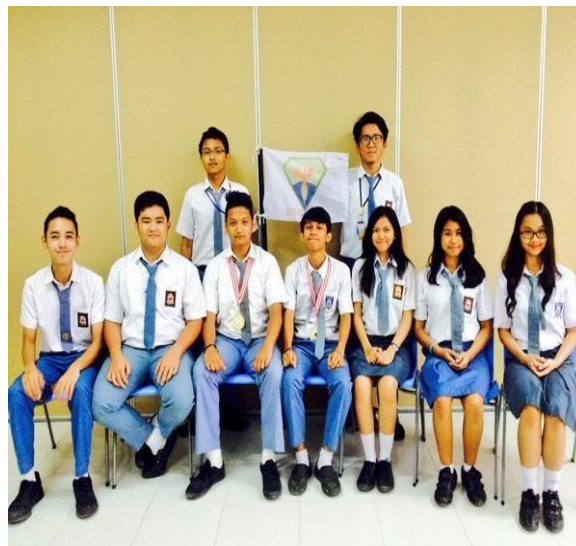
Young student from High school we visited

After graduating, many students are left standing at a cross-roads. What do I do now? Do I go out in search of my dream grad job? Shall I go travelling? What about going one step further in my academic career and pursuing a bachelor and master's degree? So these are the reason why we must let them know straightforward where they should consider in order to realize their dream in the future. They was very happy and excited because IIB Darmajaya' student could share experience and help them identifying their proper purpose.