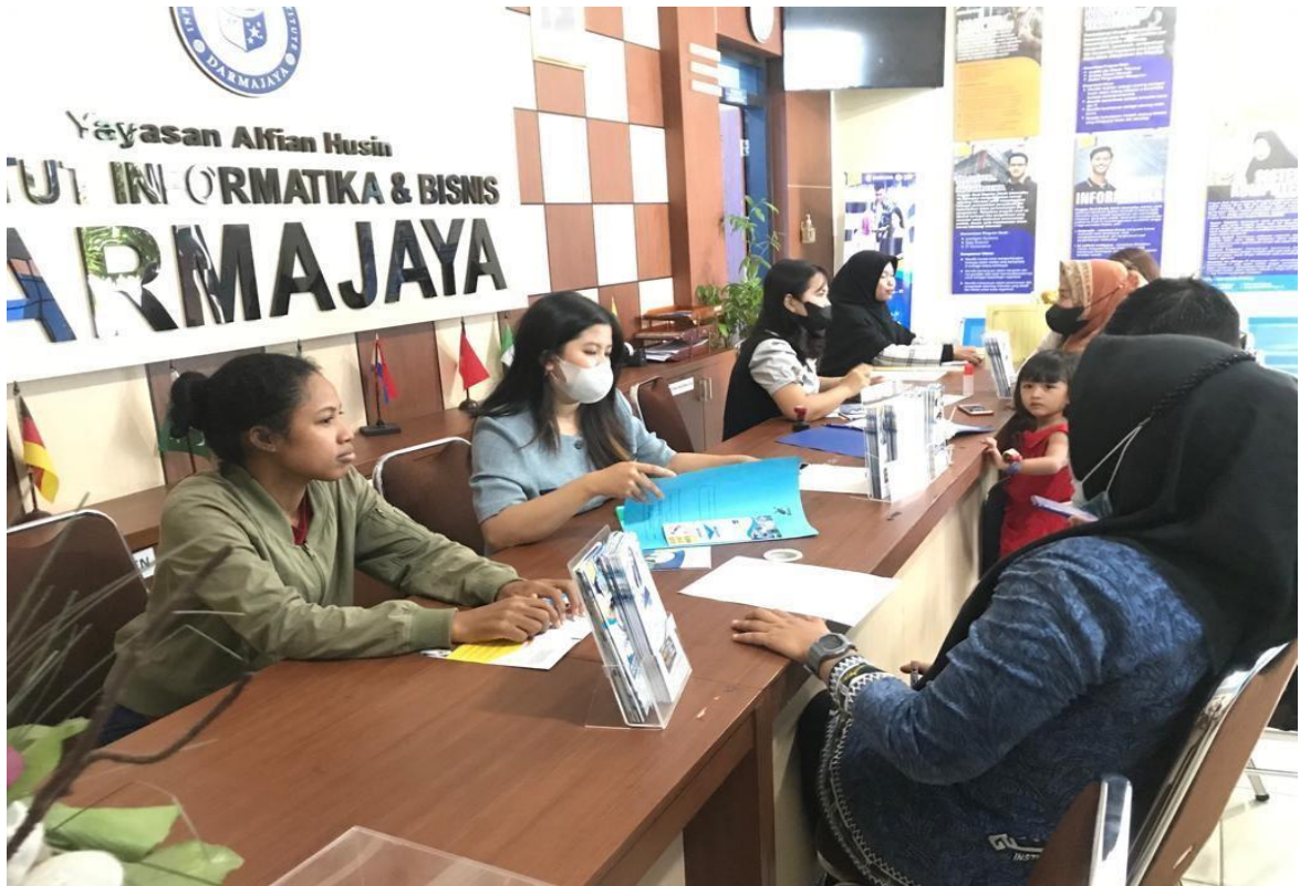
Receiving New Student at PMB

class as it helps them to improve their English skills and culture also. As an international student, I do present what we have in the campus.